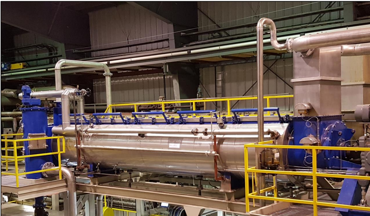
AF-TC12-8 installed in factory.